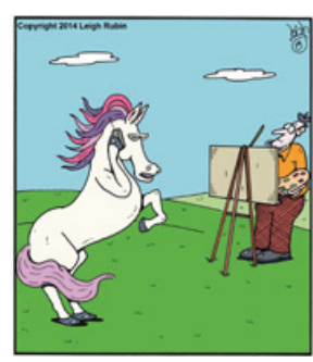
"Hey, can I call you back?... I'm capturing someone's imagination at the moment."