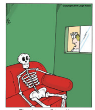
"The doctor will be with you in just five more minutes.".