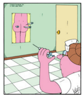
Nursing school target practice