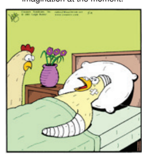
"...And the last thing I was doing was trying to cross the road... But I don't remember why."